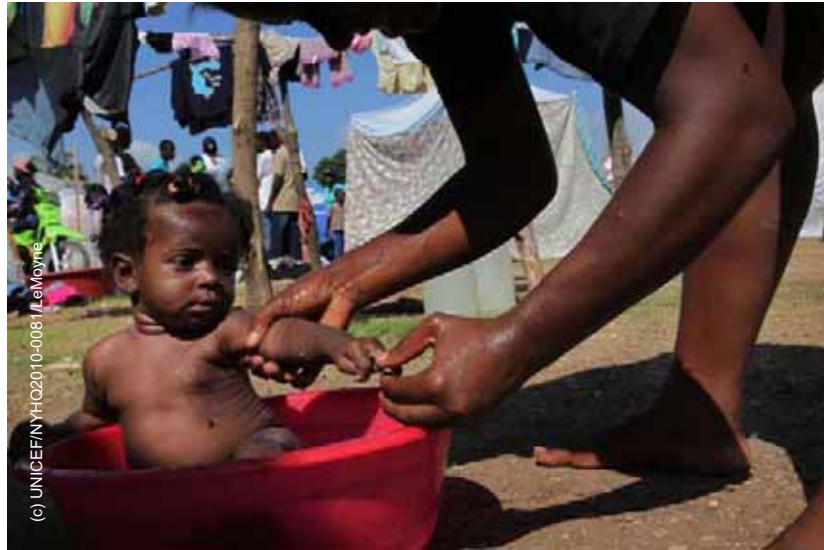
On 23 January, a woman bathes her baby daughter in a plastic basin, in the Pinchinat camp for people displaced by the earthquake, on a football pitch in the city of Jacmel.

The Nutrition Cluster has launched an independent coordination website through the OneResponse forum which includes the latest technical guidance notes, policies, coordination tools and mapping of nutrition partners and services. See: www.oneresponse.info/Disasters/Haiti/Nutrition/Pages/default.aspx