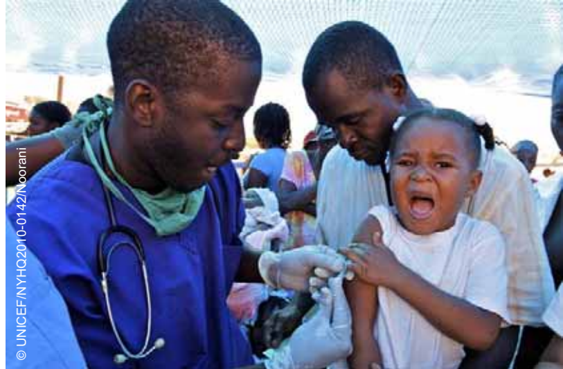
A girl, held by her father, cries as a health worker vaccinates her, at Sylvio Cator Stadium in the centre of Port-au-Prince, the capital. The stadium is serving as a temporary settlement area and is the site of the initial pilot vaccination round, carried out by the Ministry of Health and members of the Health Cluster.

As of 10 February, 65,377 Hygiene kits have been distributed by WASH Cluster partners to about 327, 000 people in the various affected areas, representing 30% coverage of the target. UNICEF has 21,000 hygiene kits in country or already distributed and has ordered 98,000 additional.